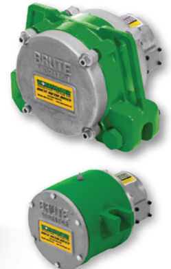
BRUTE® Hopper Car Vibrators