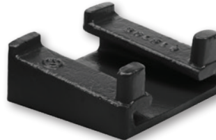
Female W/O Wedge Bracket