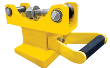
Male Wedge Cradle Lug Bracket