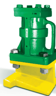
RAIL-SHAKER™ Hopper Car Pocket Vibrator