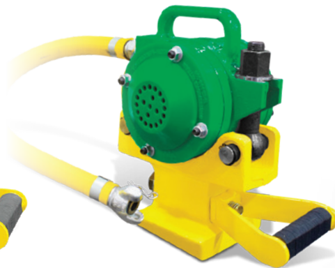
CAR-ROCKER™ Turbine Pocket Vibrator