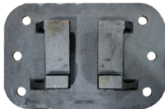
Female WO/BO Wedge Bracket