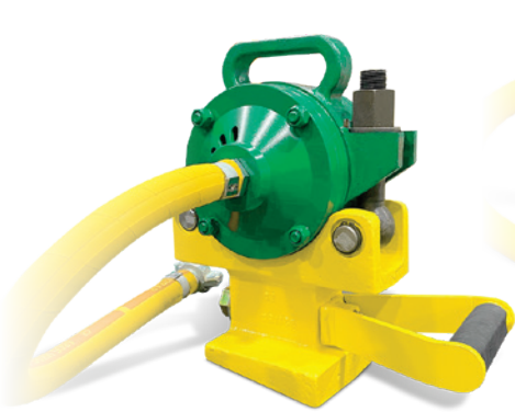
CAR-ROCKER™ Dual Roller Pocket Vibrators

With 8 models of Hopper Car Vibrators , which range in speed from 2,000 Vibrations Per Minute (VPM) to 15,000 VPM , and range in power from 1,000 Force-Lbs. to 14,000 Force-Lbs. , we've got the Vibrator needed to empty your railcars in record time no matter what material is being unloaded.